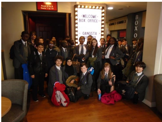
Year 7 Visit – Gangsta Granny

The academy offers a wide range of extracurricular activities and visits, some of these take place during the school day i.e. at lunchtime or after school. All of pupils at the academy are given the opportunity to take part in the activities on offer, with reasonable adjustments made to all include all young people with SEND when possible.