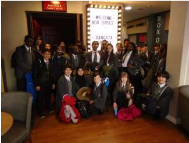
Year 7 Visit – Gangsta Granny